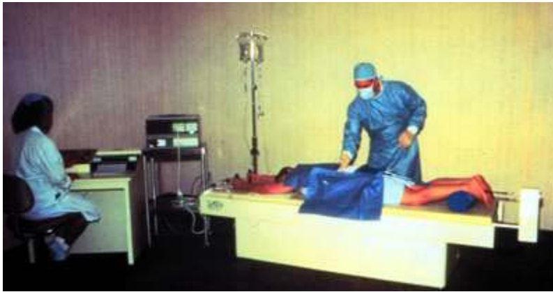
Fig. 1. Photograph illustrating the equipment and the position of the patient as the system is activated. The caudal end of the table extends, applying tension to the pelvic belt. Upper body movement is restrained by having the patient grasp the hand grips. A graph of the tension applied is plotted by a chart recorder on the control console and the intradiscal pressure readings are entered on the same graph at the apex of each distraction curve.

A new form of therapy, termed "vertebral axial decompression," has recently been introduced in the physical therapy department of the Rio Grande Regional Hospital. This treatment modality has shown considerable promise in relieving low-back pain associated with herniated discs or degenerative disc disease of the lumbar vertebrae in patients who are not considered candidates for surgery. The purpose of this research project was to investigate the influence of this new treatment modality on intradiscal pressure in the lumbar spine of patients receiving this form of therapy.