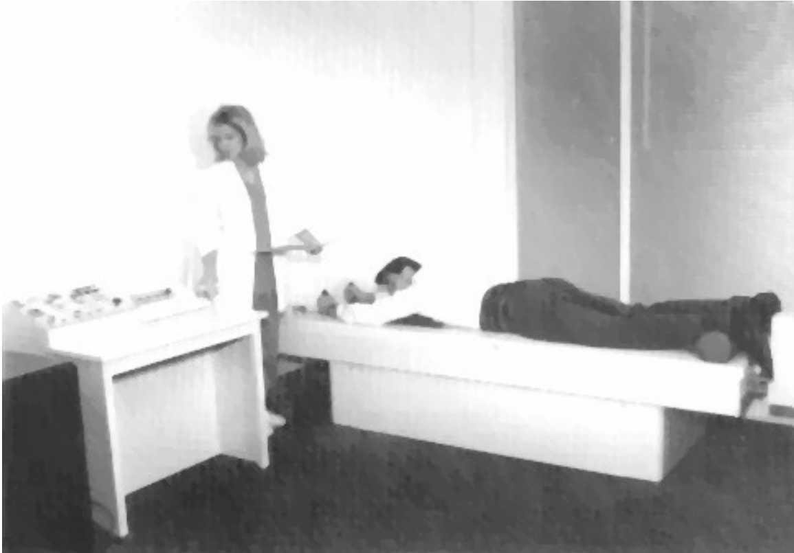
Figure 1: Patient undergoing treatment on the VAX-D Therapy Table

The blood supply to the nerve roots of the cauda equina is sensitive to compression. Even at pressures of only 5-10 mmHg, the flow in over 20% of the venules was completely stopped (6). Flow in all the capillaries stopped at pressures between 20 and 50 mmHg. A pressure of 30 mmHg is slightly less than one pound per square inch, so solute transport is easily reduced. Even vertebral distractions (increased separation) of 1 or 2 mm per disc would reduce ligamental redundancy and help to restore canal/foraminal patency, reduce venous congestion and increase axoplasmic flow. Furthermore, the effects of lumbar spine lengthening may be sustained for a period of time after lumbar distraction has been stopped.